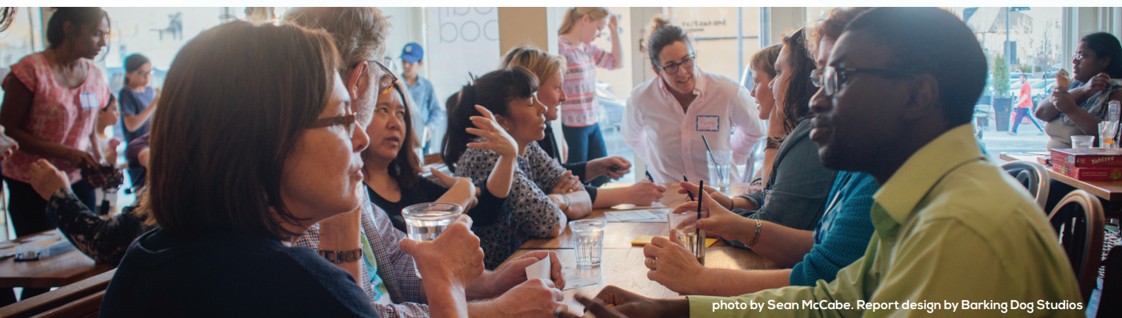
Report design by Barking Dog Studios